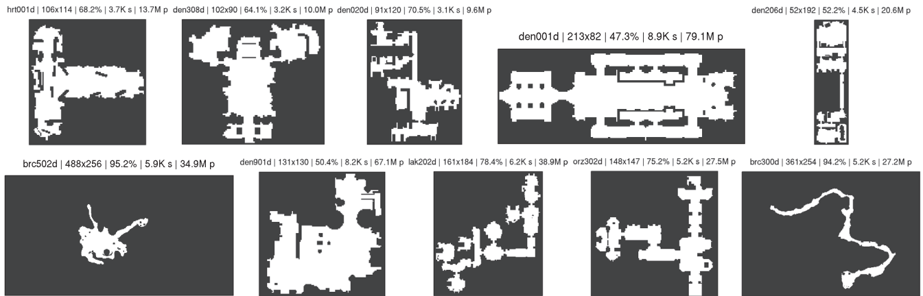
Figure 2: The ten Dragon Age: Origins maps used in our experiments.